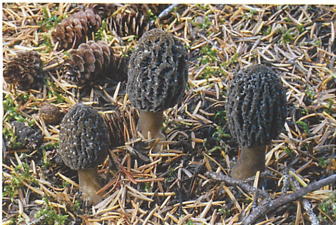
Gray fire morel / Morchella tomentosa