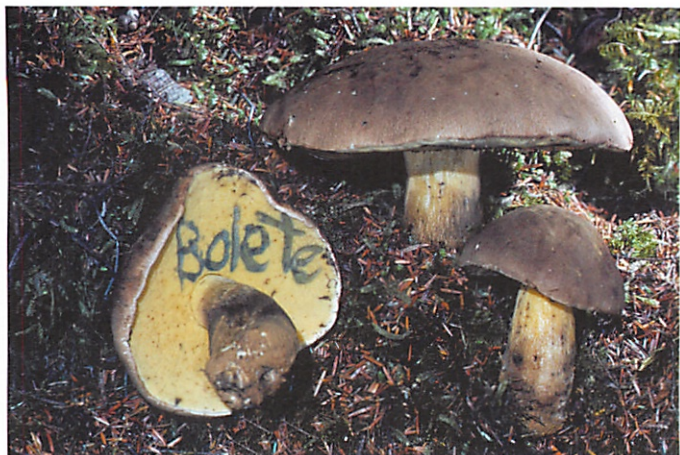
Boletus coniferarum