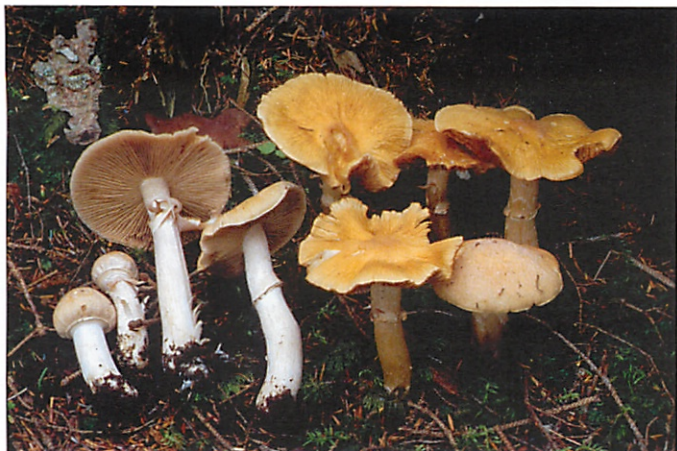
Gypsy / Cortinarius caperatus