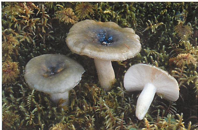
Green russula / Russula aeruginea