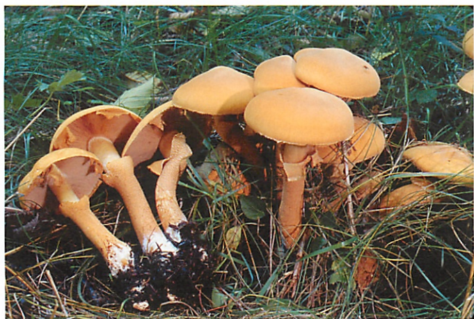
Alaskan gold / Phaeolepiota aurea