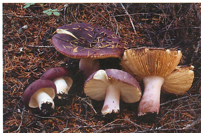
Shrimp russula / Russula xerampelina