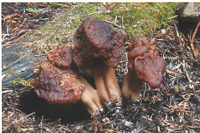
Spring false morel / Gyromitra esculenta