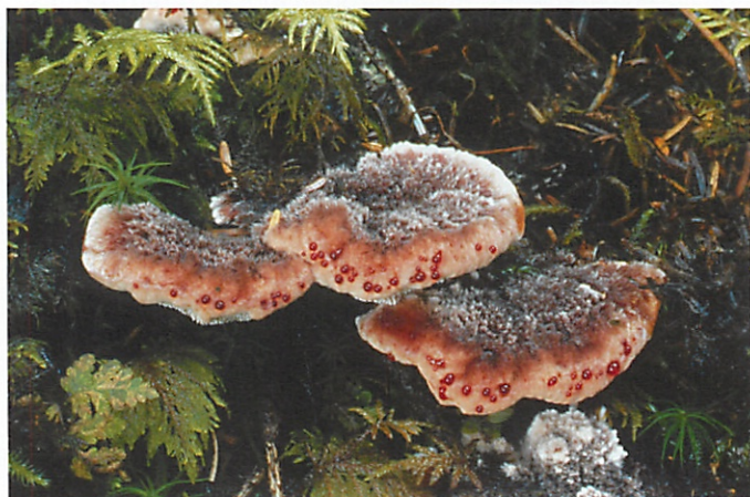
Strawberries and cream / Hydnellum peckii