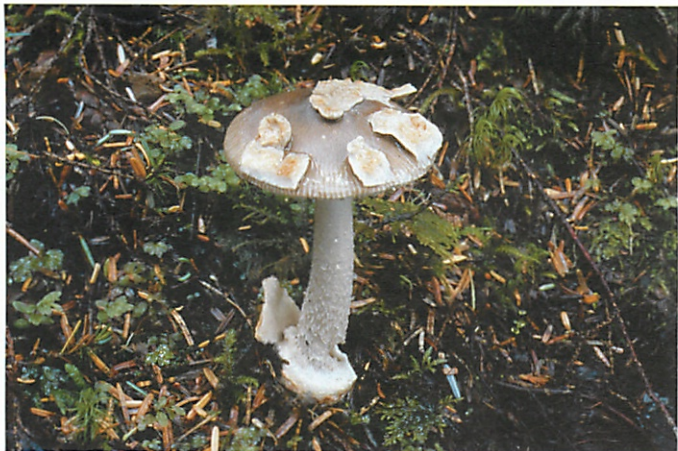
Grisette / Amanita vaginata group