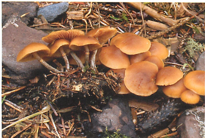
Deadly galerina / Galerina marginata