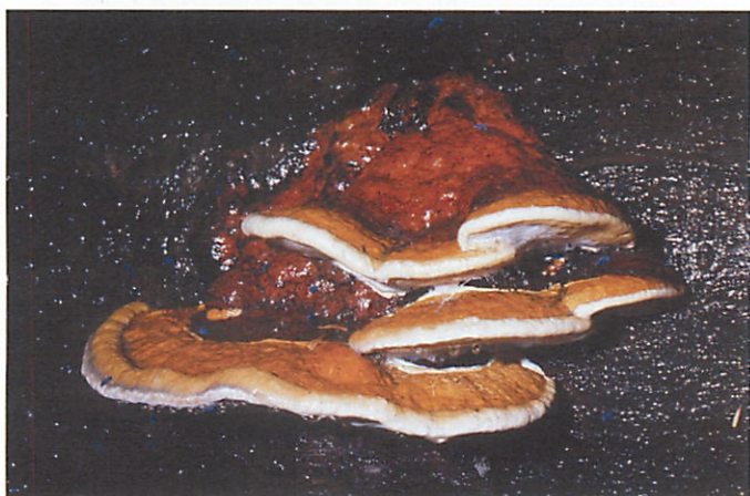
Red-belt conk / Fomitopsis pinicola