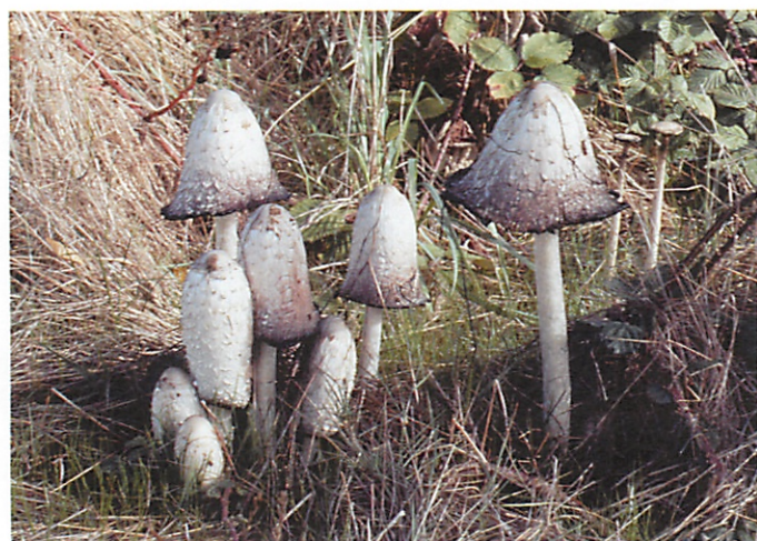
Shaggy mane / Coprinus comatus