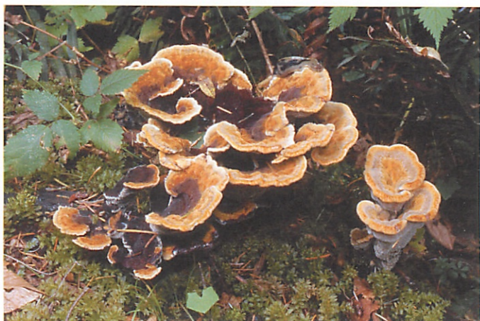
Dyers' polypore / Phaeolus schweinitzii