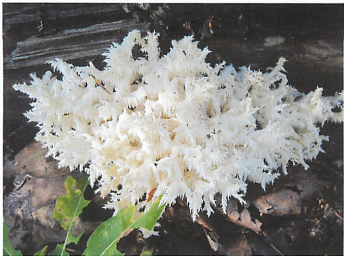
Bear's head / Hericium coralloides