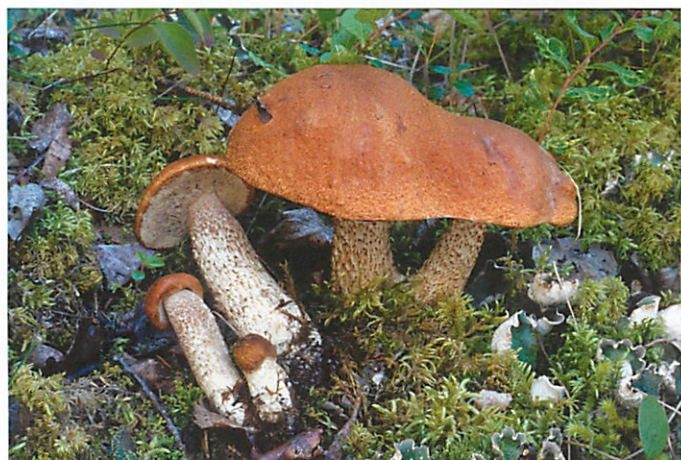
Aspen scaber-stalk / Leccinum insigne