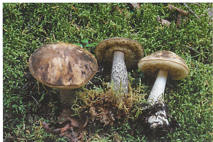
Alaskan scaber-stalk / Leccinum alaskanum