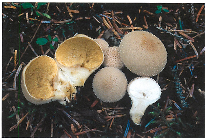
Gemmed puffball / Lycoperdon perlatum

Puffballs are round and “puff” their spores upward when struck by raindrops or poked with a finger. The medium to large species with a white, marshmallow-like interior often are collected for food. However, many of the similar-looking earthballs are quite poisonous, especially for pets, and so great care must be taken to insure correct identification. The gemmed puffball is common in southern Alaska. Its fruiting bodies are small, round to pear-shaped, cream colored, and have pointy warts. The flesh is soft and pure white when young, turns olive-green and gooey with age, and progresses to an olive-brown powdery mass when mature.