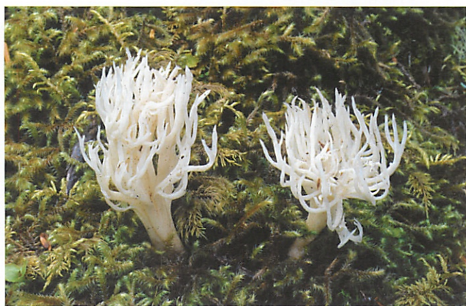
Crested coral / Clavulina cristata group