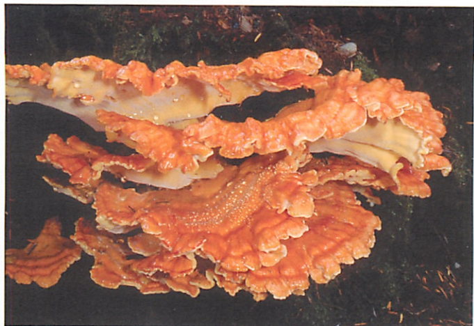
Sulfur shelf, chicken of the woods / Laetiporus conifericola