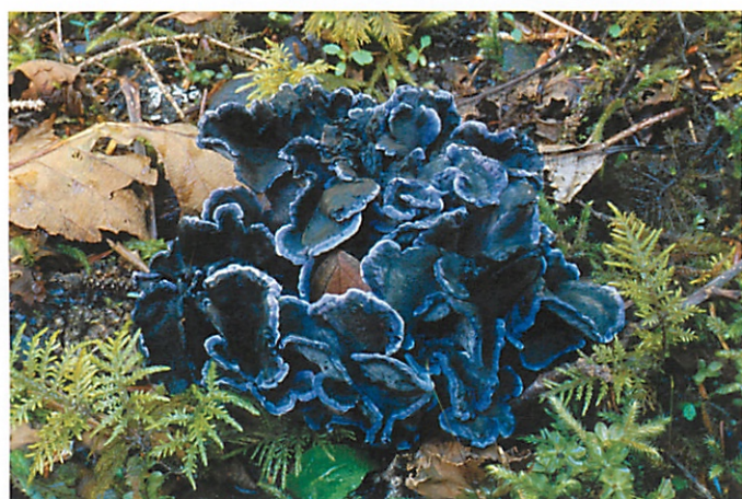
Blue or black chanterelle / Polyozellus multiplex