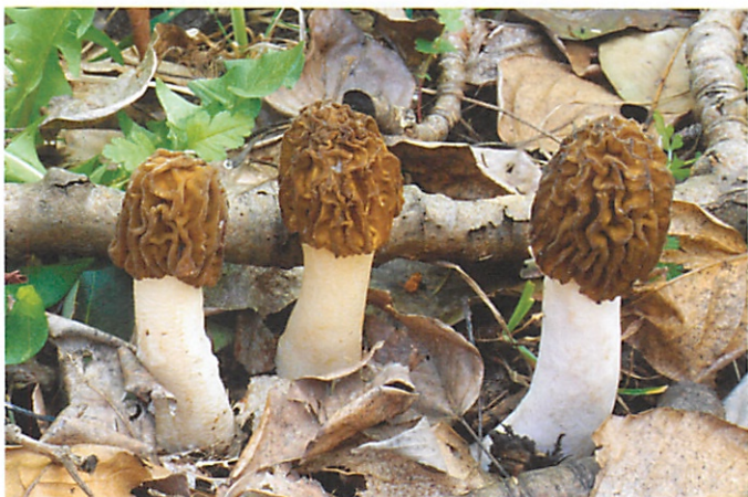
Early false morel / Verpa bohemica