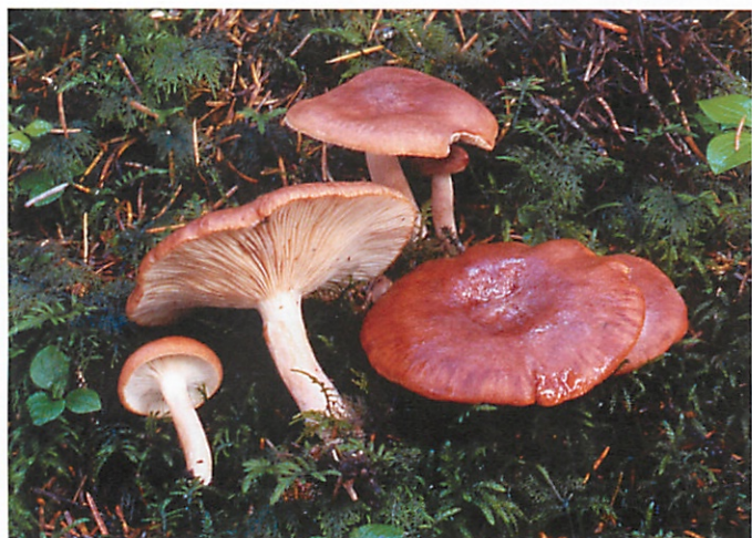
Red hot milk-cap / Lactarius rufus