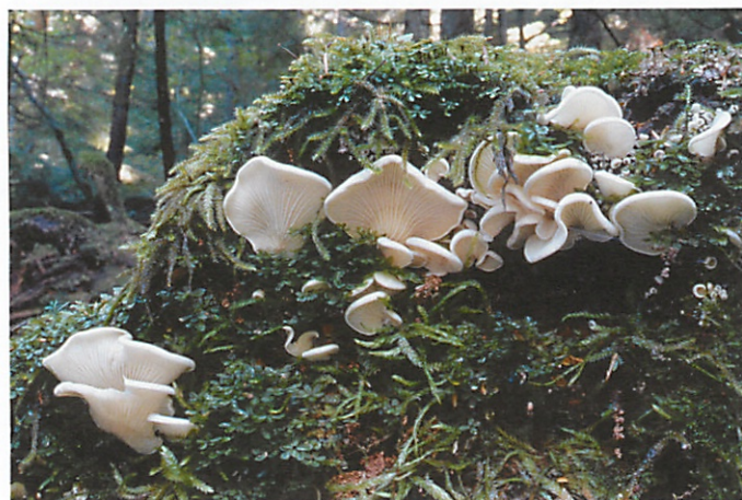
Angel wings / Pleurocybella porrigens