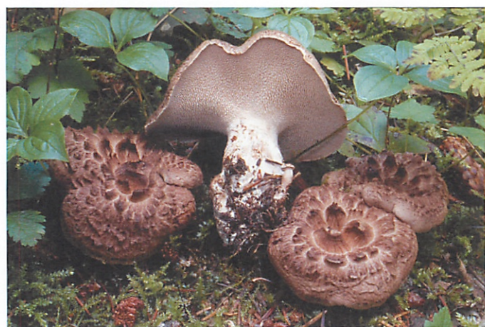
Hawk wing / Sarcodon imbricatus