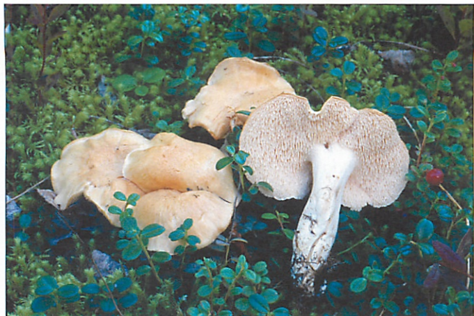
Hedgehog, sweet tooth / Hydnum repandum