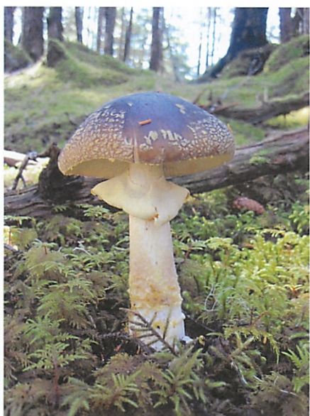
Yellow patches / Amanita augusta