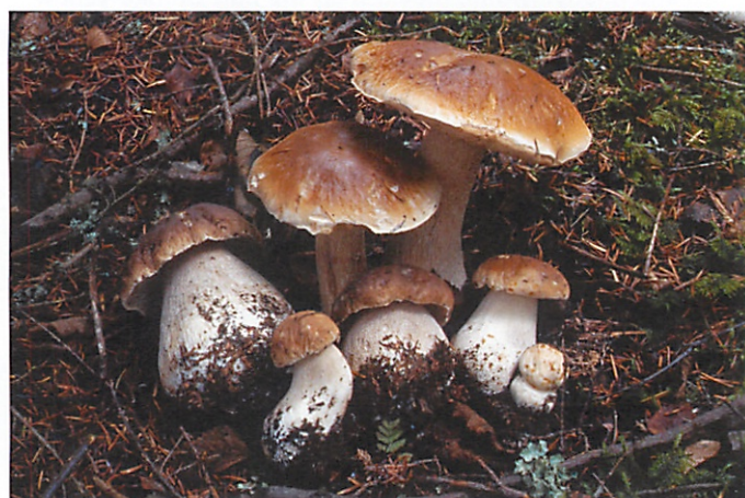
King bolete / Boletus edulis