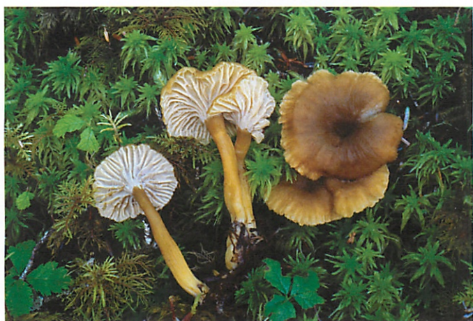
Winter chanterelle, yellow foot / Craterellus tubaeformis