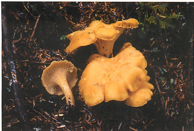
Pacific golden chanterelle / Cantharellus formosus