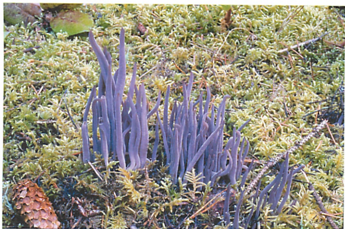
Purple fairy club / Alloclavaria purpurea