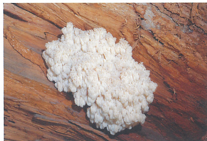
Bear's head / Hericium abietis