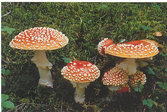
Fly agaric / Amanita muscaria 8 U.S. Forest Service, Alaska Region