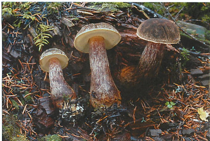
Admirable bolete / Boletus mirabilis