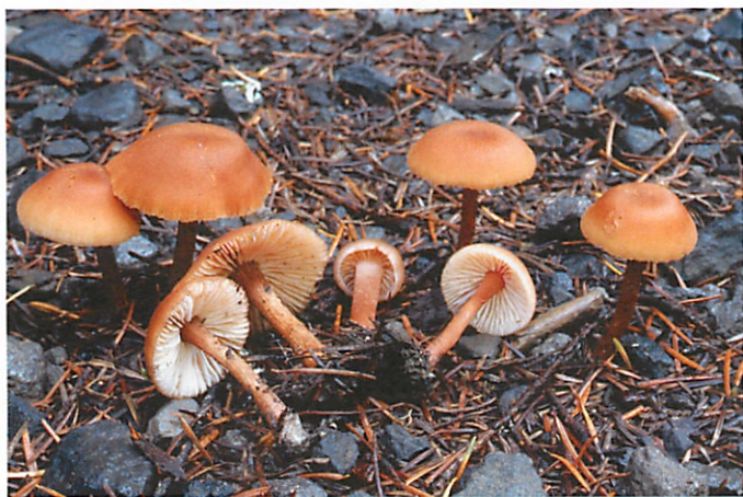
Lackluster laccaria / Laccaria laccata