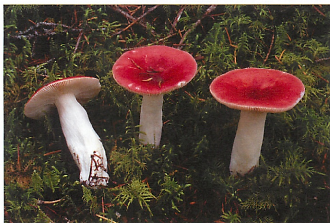
The sickener / Russula emetica