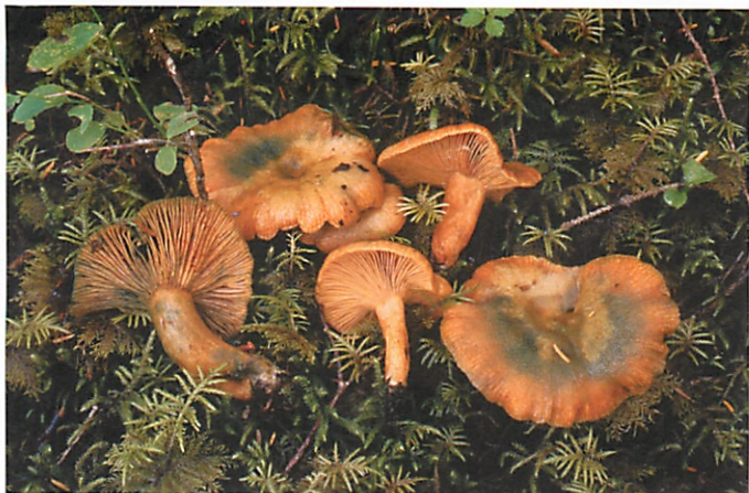
Orange milk-cap / Lactarius deliciosus group