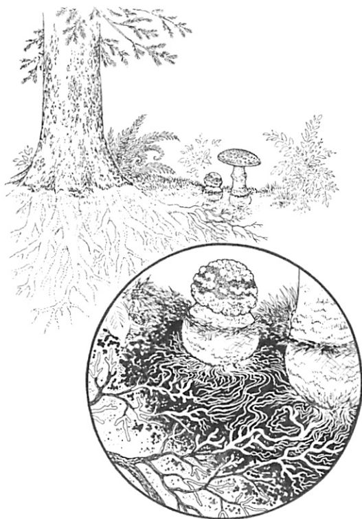
Figure 3. An ectomycorrhizal association between a spruce tree and Amanita muscaria , the fly agaric.